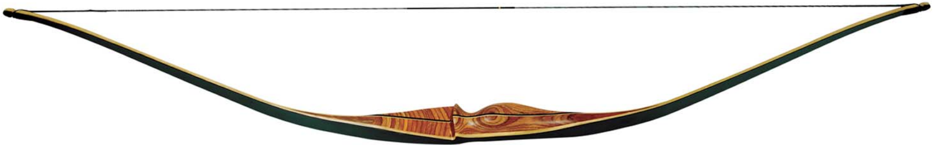
The Carbon Striker Bamboo & Military Grade Carbon Fiber. - $1,900