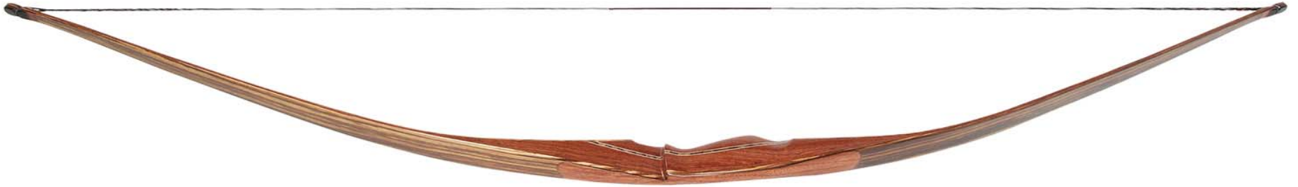
The "Savannah" Named after the town of Savannah, TN. - $1,600